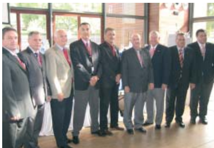
After the election: the new CTIF Executive Committee