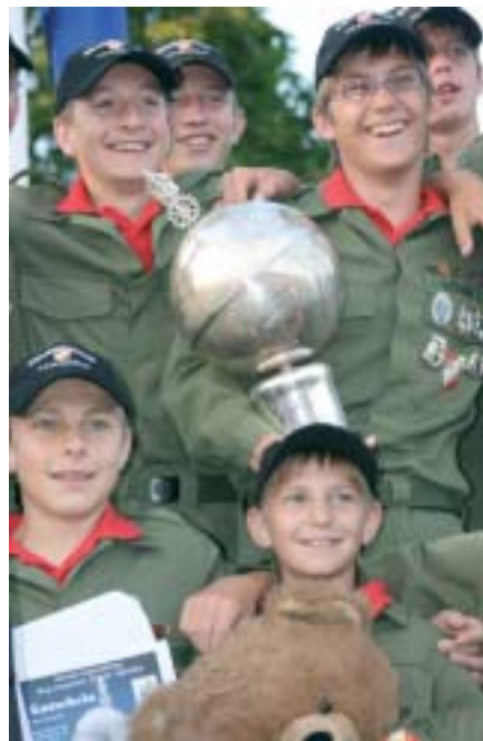
The youth leader commission was also responsible for the international youth fire brigade competition in Revinge (Sweden)