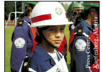
Press Centre Kapfenberg, Austria

The commission met in Ostrava, Czech Republic, in March to prepare the CTIF Youth Fire Brigades Competitions 2009, along with its colleagues from the CTIF International Fire Brigades Competitions Commission. It also met in Stuttgart, Germany, in October.