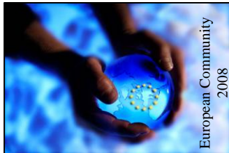
European Community 2008

The commission met twice in France, in April in Paris and in September in Colmar to discuss the consequences of the European Union working time directive on volunteer fire fighting activities (see p.3).