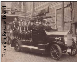
Estonian Rescue Board

The commission met in September in the National Fire Fighters Museum in Myslowice, Poland, where it welcomed new members from Denmark, Luxemburg and Greece. This museum was the 4 th to be certified by the commission and hence joins Pribyslav (Czech Republic), Rakoniewice (Poland) and Fulda (Germany). The commission currently examines the application of the Styrian Fire Museum (Austria). A conference was organised along the meeting on the evolution of equipments designed to protect the head of fire fighters.