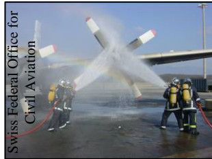
Swiss Federal Office for Civil Aviation

The commission met in June in Durham Tees Valley Airport, UK. Swiss training procedures, Norwegian crisis management and the UK Airport Fire Service Association were introduced. The